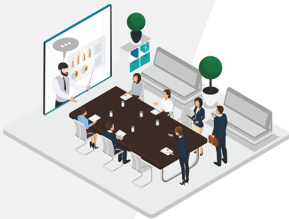
High Caliber Faculty