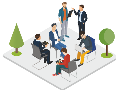
Become a member of the TAPMI Alumni Network