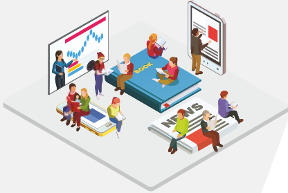
Executive PG Program in Management