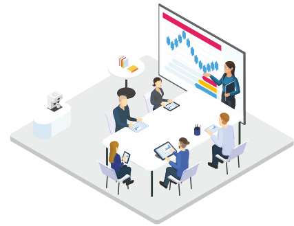
Interactive & Applied Learning